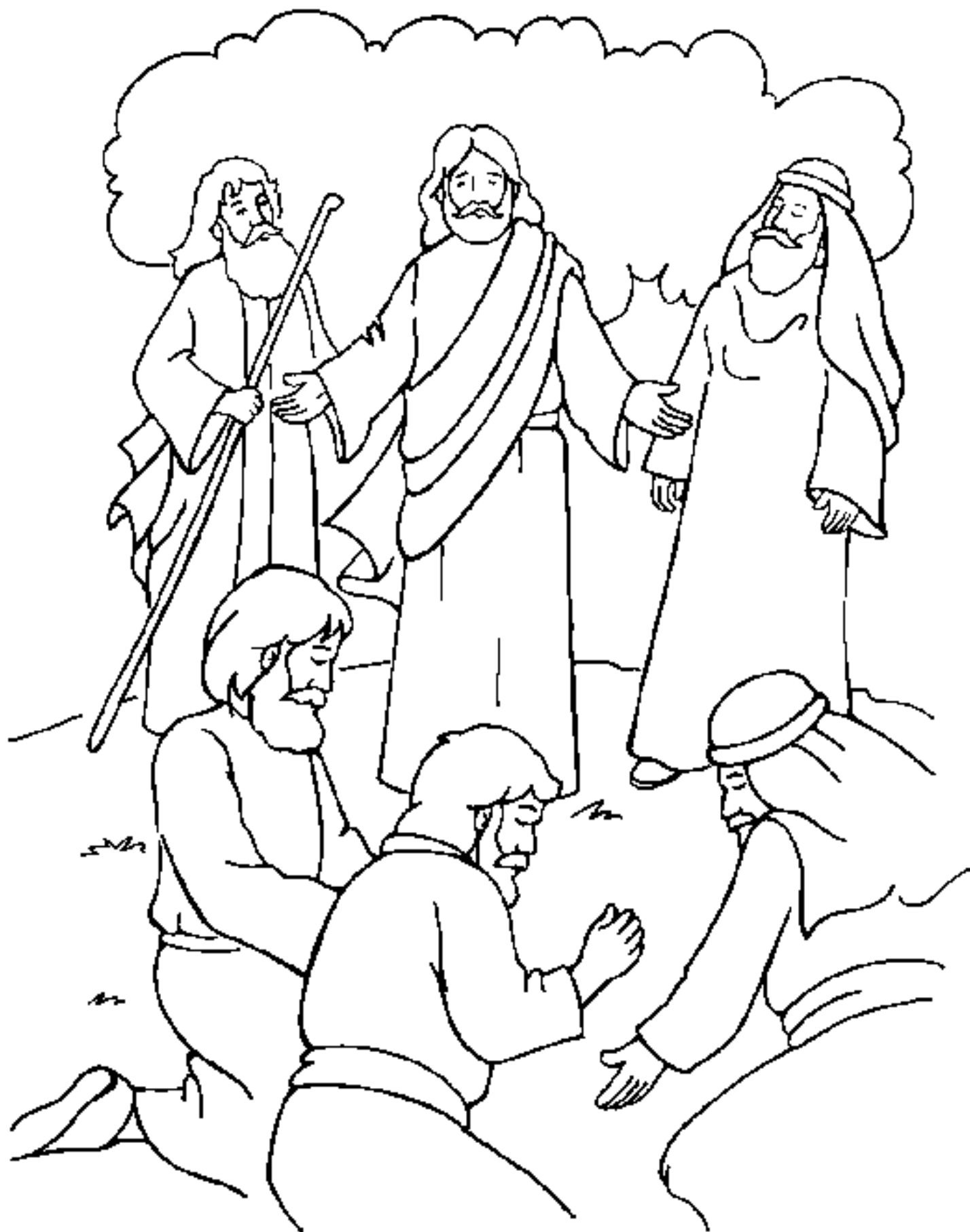
The Mount of Transfiguration Mark 9:2-9